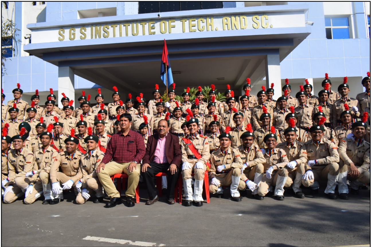
NCC SGSITS (Official Photograph), 2020