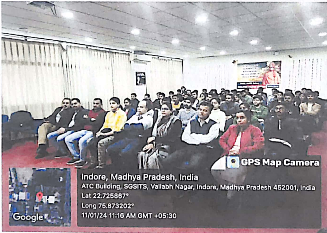
Audience engaged in the lecture