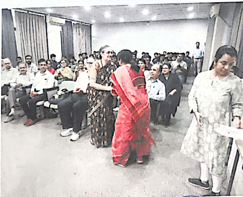
Welcoming the guests