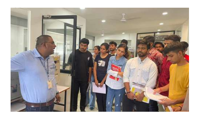
Industrial Visit - KAILTECH TEST AND RESEARCH CENTER PVT. LTD.