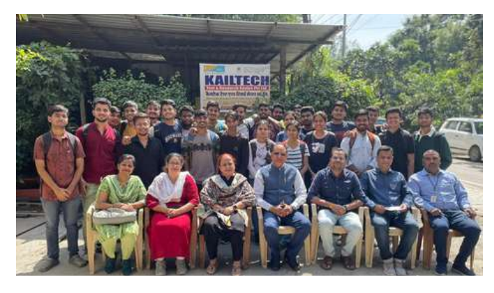
Industrial visit- Faculty, students and CEO, Director of Kailtech TEST AND RESEARCH CENTER PVT. LTD,

Innovation cell of the department has organized industrial visit for B.E. third year students to Kailtech Test and Research Center Pvt. Ltd. Its one of the biggest Test and Calibration lab accredited by NABL and recognized by BIS. It provide services in various domains such as Civil, Mechanical, Electrical, Electronics, Chemical etc.