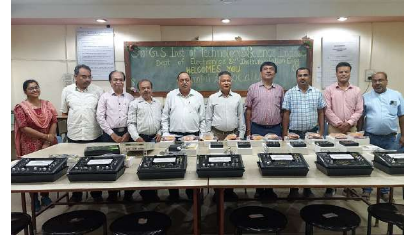
Director SGSITS, Indore, Head, EI Department along with other staff members and Alumni of SGSITS.

the labs that are benefited by this Alumni efforts.