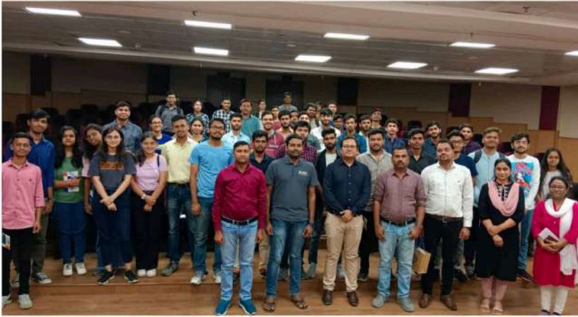
III year students along with Faculty members of the department at IIT Indore

Students of department got an excellent opportunity to visit IIT, Indore. Students were taken to various laboratories like Basic Electrical & Electronics lab, Machine lab, Antenna Design, SARAL unit, RF lab, NSDCS lab etc. Students explored the research area of electronics field and various opportunities available at IIT Indore.