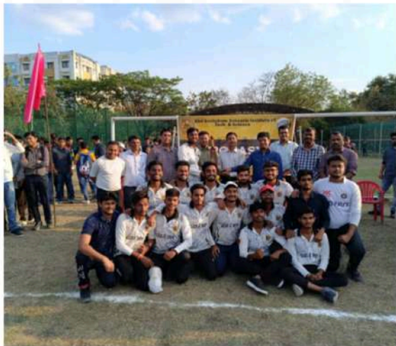
Electronics & Instrumentation Cricket Team