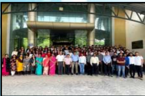
Pass out batch (2018-22)

Dreams for a better world are the best. I love you all. May almighty give you courage and hope throughout your life.