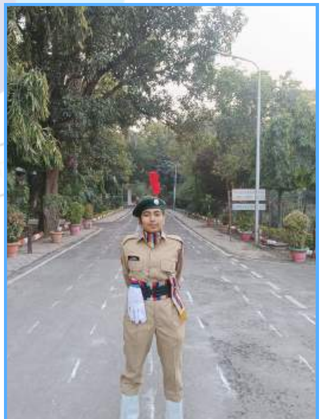
ARMY ATTACHMENT CAMP(AAC)