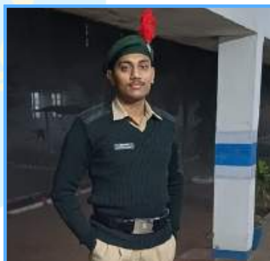
ARMY ATTACHMENT CAMP