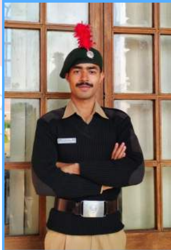
INDIAN MILITARY ACADEMY ATTACHMENT CAMP(IMAAC)