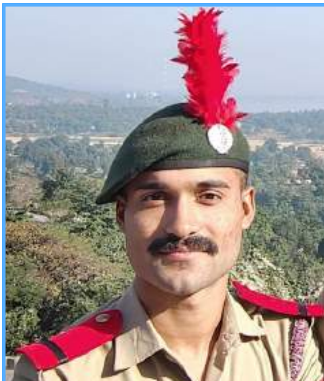
ALL INDIA TREKKING CAMP