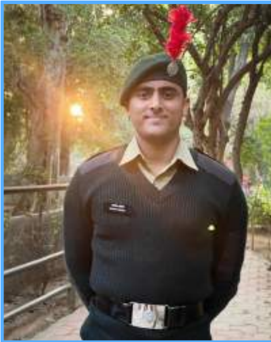
ARMY ATTACHMENT CAMP(AAC)