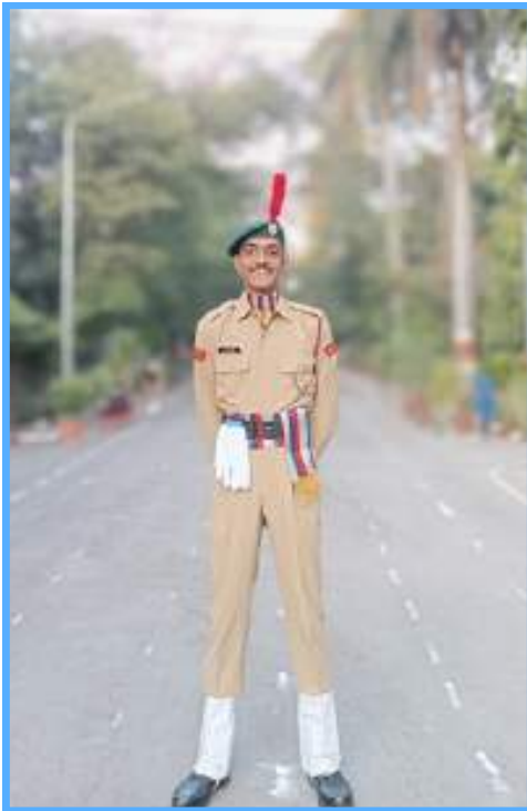
EK BHARAT SHRESHTHA BHARAT CAMP(EBSB)