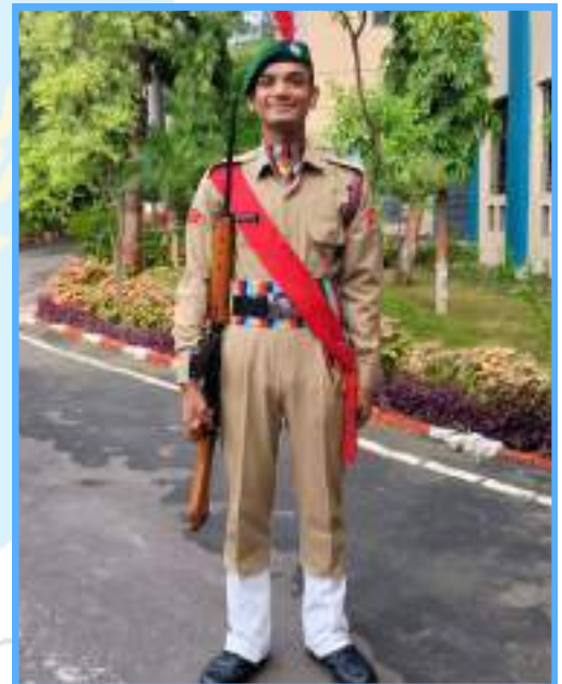
ARMY ATTACHMENT CAMP(AAC)