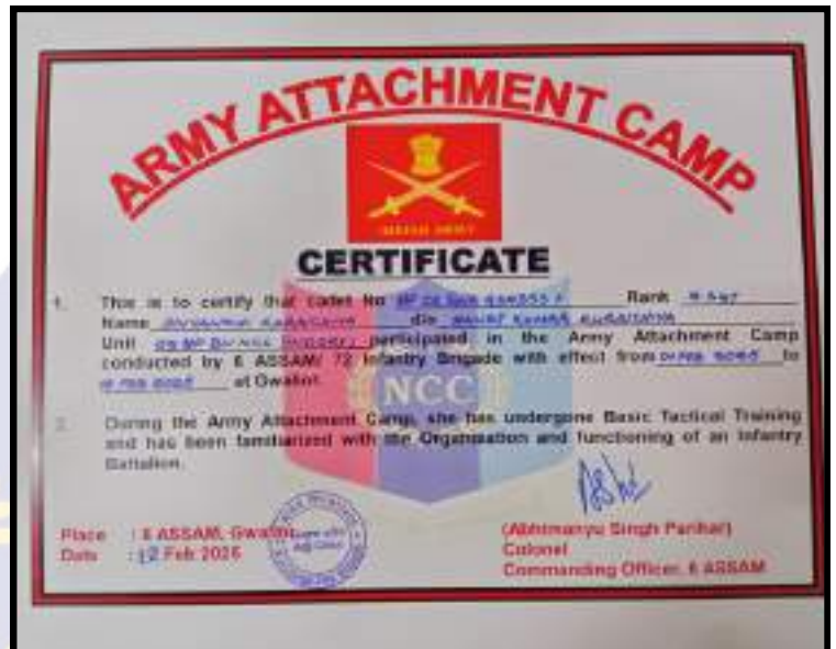
ARMY ATTACHMENT CAMP(AAC)