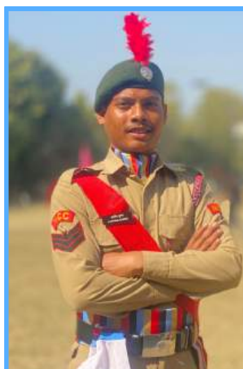
ARMY ATTACHMENT CAMP